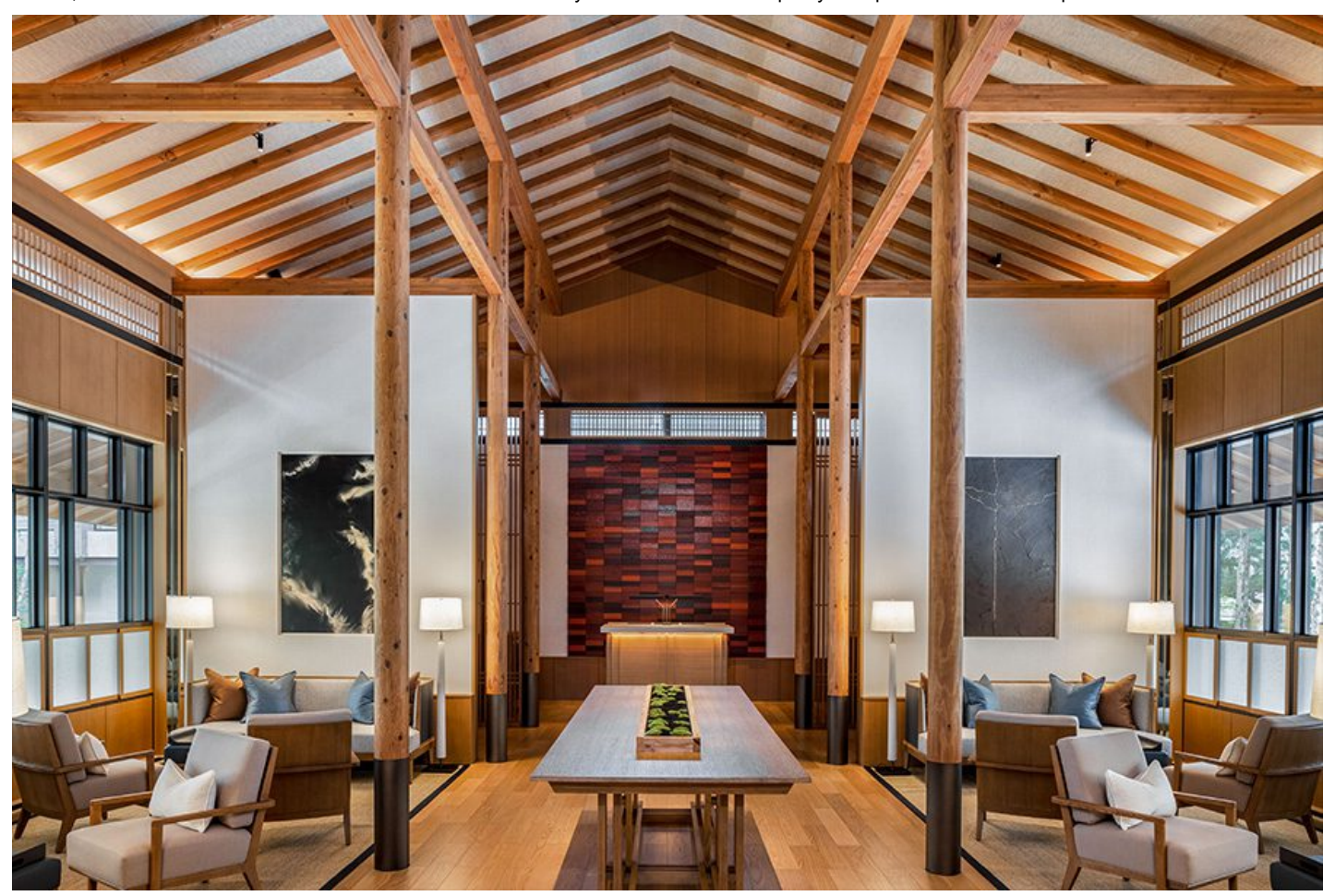
The public space nods to Kyoto architecture with high-pitched ceilings, while the reception desk is backed by a bespoke wall made from a Japanese lacquer called urushi

To reflect the various artisanal elements of the Kyoto region and to honor the Rinpa movement through its use of materials, every area of the hotel has its own theme of craftsmanship, Nagata says. The lobby and tea lounge showcase traditional lacquerware, while the spa features bamboo-shaped ceramics, including a bespoke wall made from Japanese tiles baked in a kiln tunnel for more than 24 hours. Reflecting Kyoto's shrines, Tenji restaurant features a bar with blue-rusted copper wine shelves, terrace dining alongside the river, and bamboo weave-patterned screens—a recurring motif throughout.