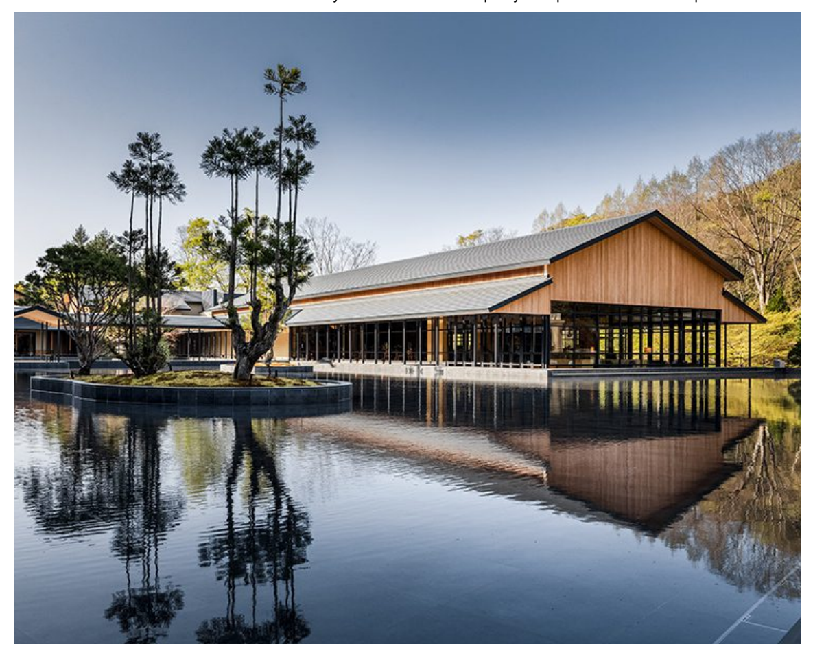
Light woods, vertical pillars, and external walkways are all connected by reflective pools and gardens at Roku Kyoto