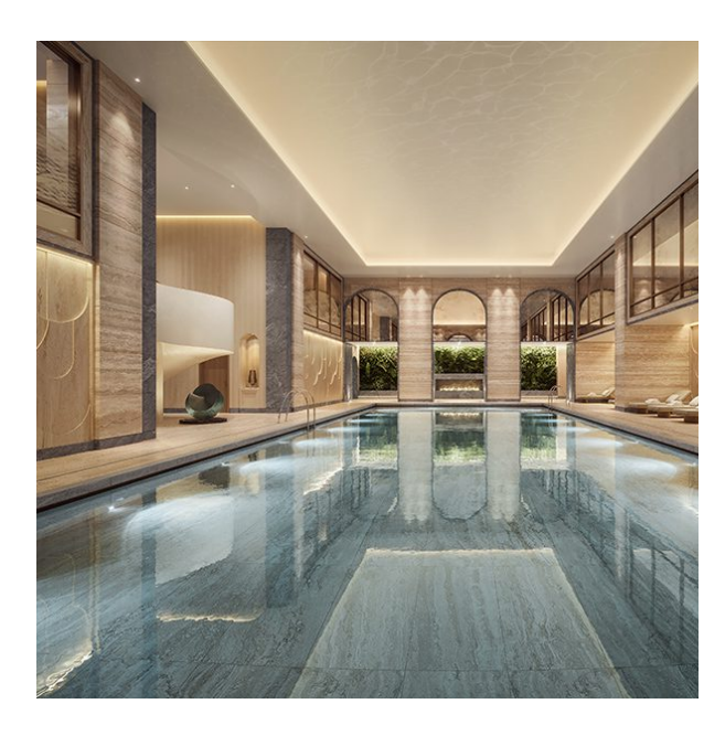
PROJECTS HOTELS + RESORTS